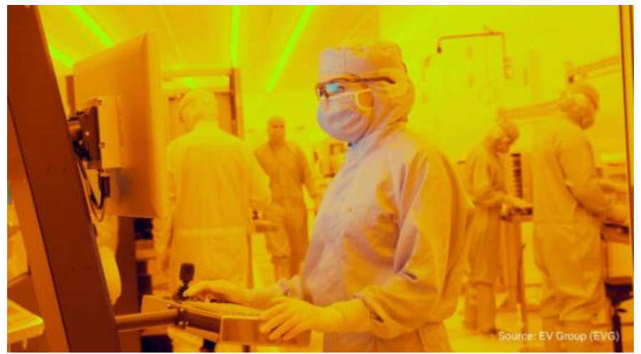
EV Group launches EVG S&R Mastering Shop™ at corporate headquarters.

EV Group (EVG), a supplier of wafer bonding and lithography equipment for the MEMS, nanotechnology, and semiconductor markets, today announced that it has established the EVG Step-and-Repeat (S&R) Mastering Shop, a new service offering to help customers accelerate the deployment of nanoimprint lithography (NIL) in high-volume manufacturing. The EVG S&R Mastering Shop uses EVG's own equipment and cleanroom facilities to provide contract manufacturing of large-area master templates and stamps, which are used to produce working stamps for wafer-level and panel-level NIL processing. By eliminating the capital costs associated with owning dedicated S&R systems for master stamp fabrication, customers can more easily integrate NIL technology in their new product designs. Devices and applications benefiting from EVG's S&R NIL solutions include augmented reality waveguides, advanced micro-optics for optical sensors, micro-lenses, nanophotonics and silicon photonics. The EVG S&R Mastering Shop is a key addition to EVG's NILPhotonics Competence Center framework, located at EVG's corporate headquarters in Austria.